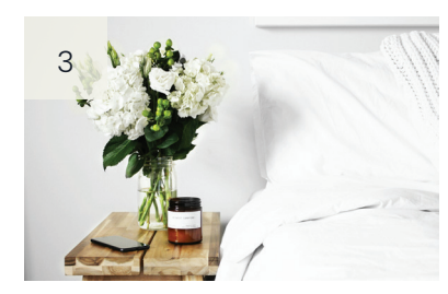
Presenting your property.